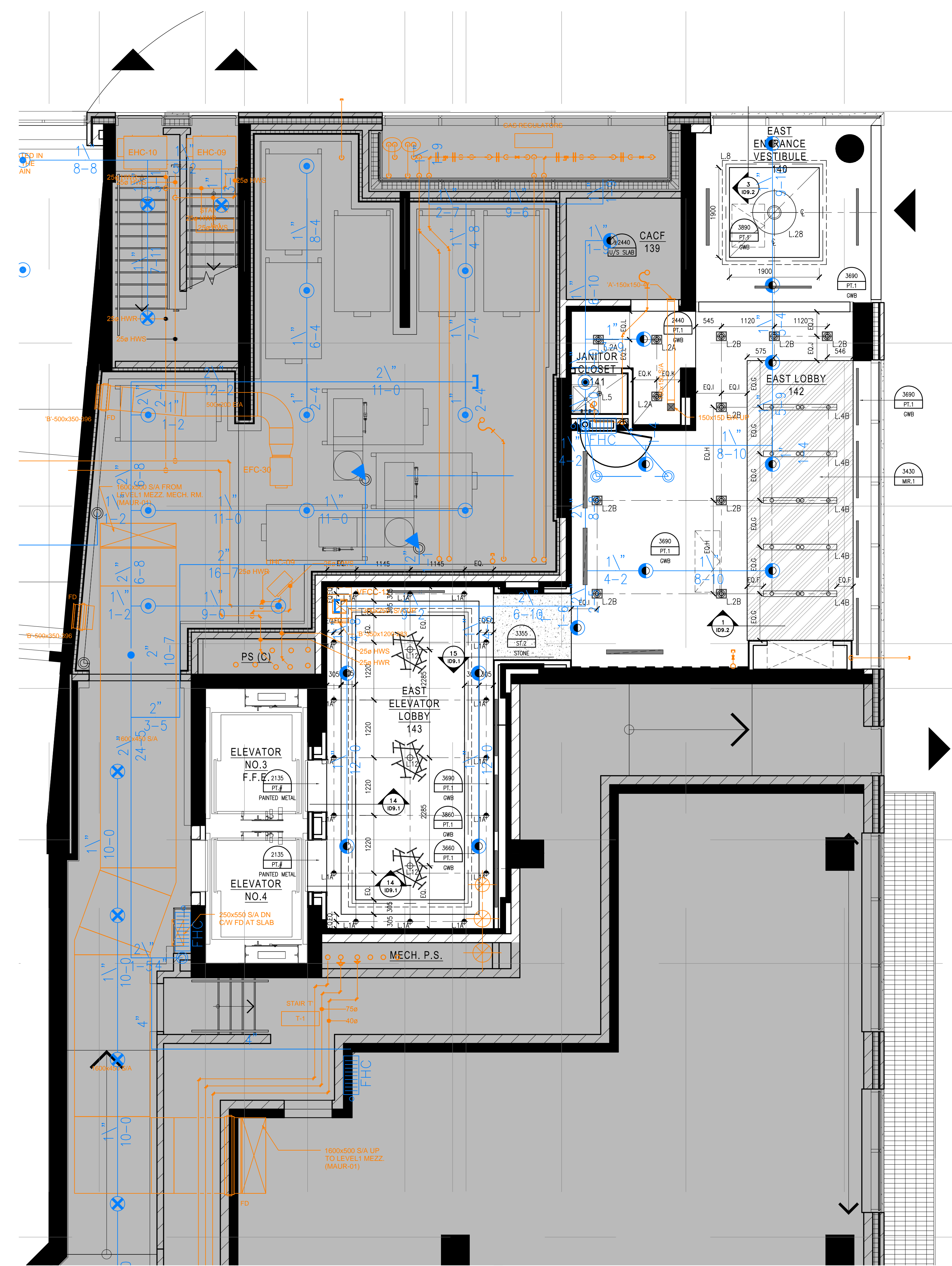
2 REFLECTED CEILING PLAN SCALE: 1:50